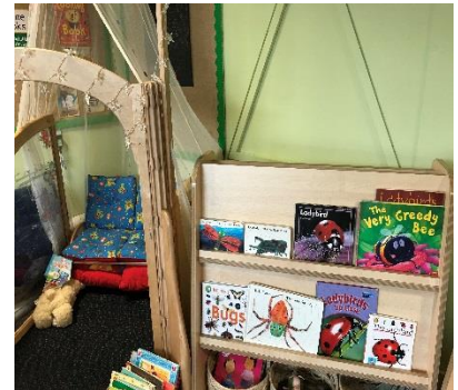
Nursery and their interesting, wriggly creepy crawly things!