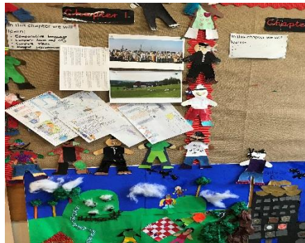
Year 4 topic looking at the town and the countryside.