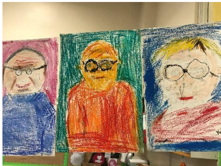
Year 2 portraits of David Hockney